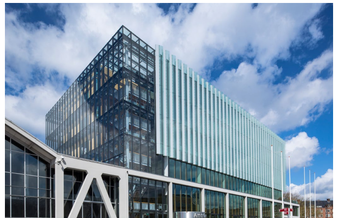
Layers — Facade