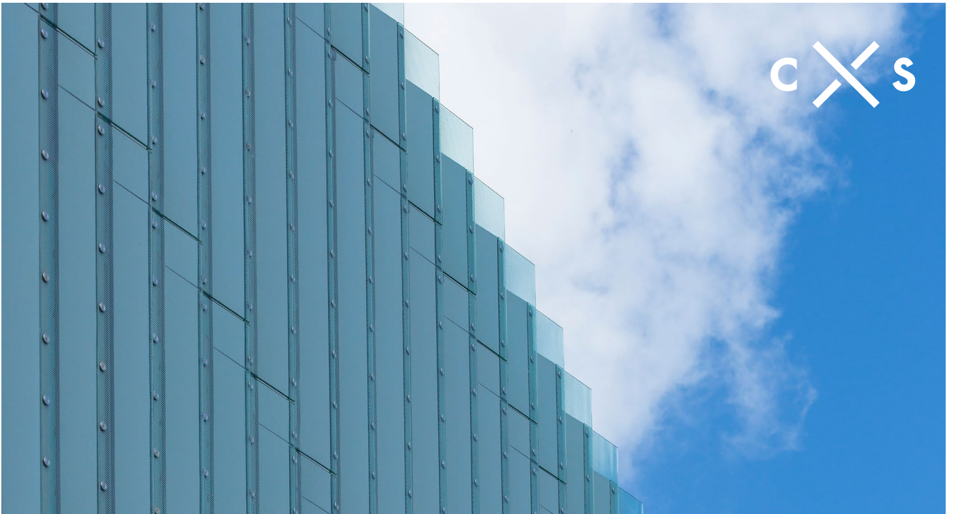
Detail — Facade

For any further information, please don't hesitate to contact us by phone +49 241 559 45 0 or e-mail at office@cross-architecture.net