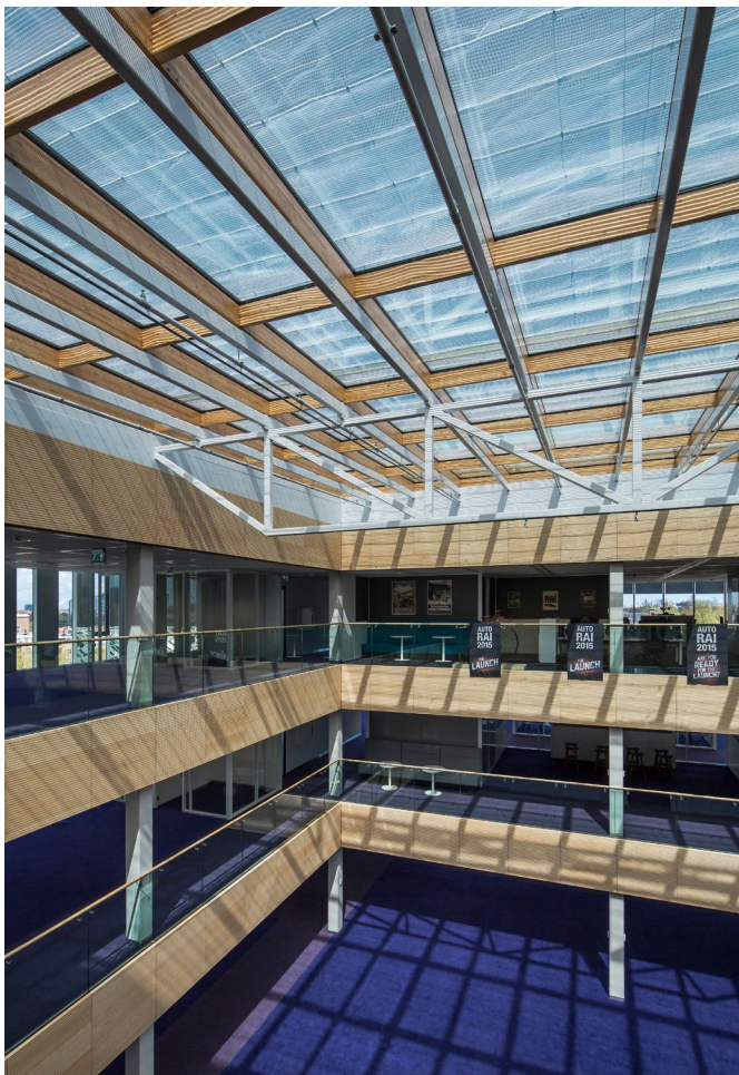
Atrium — Amtrium